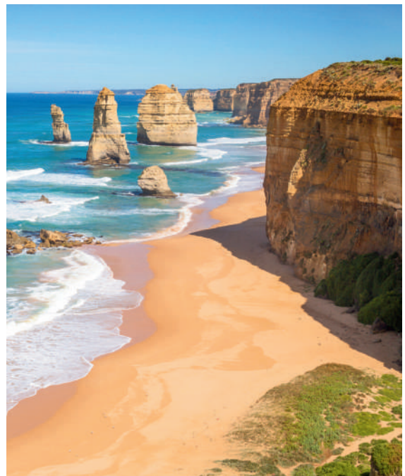
Photo: The Twelve Apostles, Great Ocean Road