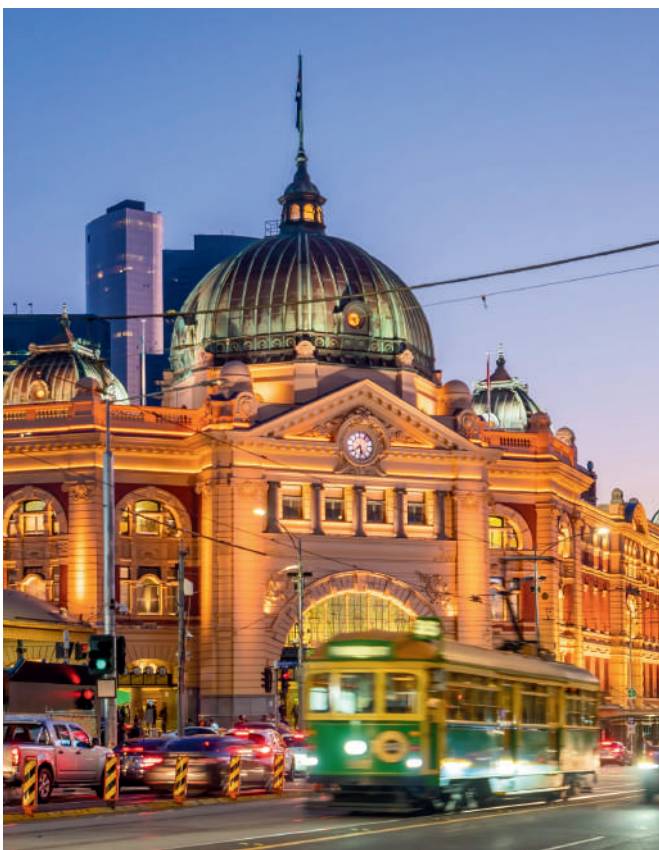
Photo: Melbourne's iconic Flinders Street Station