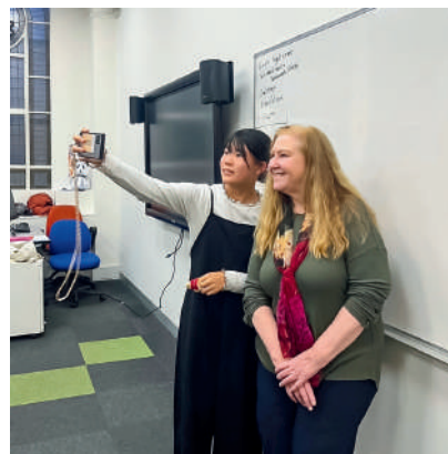
Photo: Junior student with their English teacher