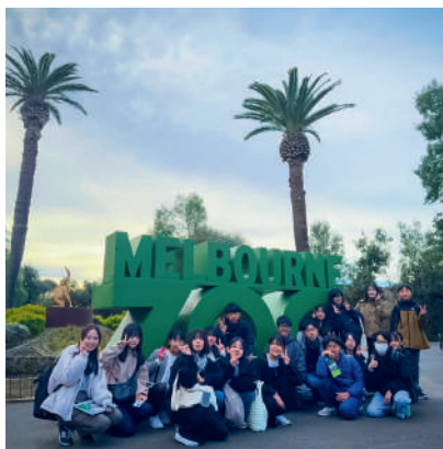
Photo: Our junior students visiting the Melbourne Zoo