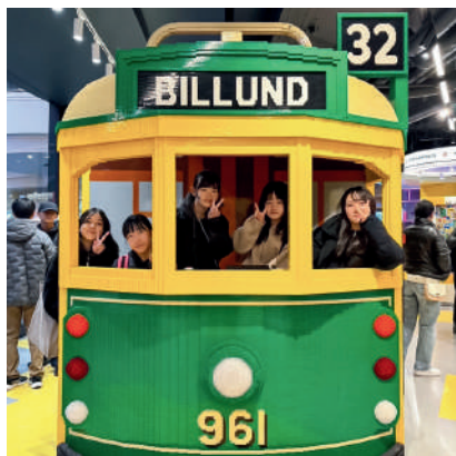
Photo: The iconic Tram 32 at Melbourne's LEGO store

Take a glimpse into the incredible experiences of our past students. From interactive classes to thrilling excursions, every moment is a step toward growth and learning!